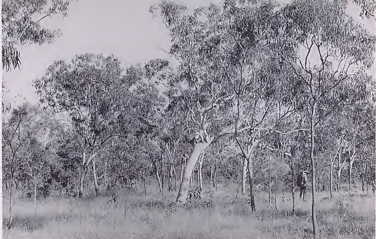
Figure 5. Eucalyptus bleeseri - E. tetradonta - E. miniata association on lateritised sandstone (or basalt) on Pim Hill.